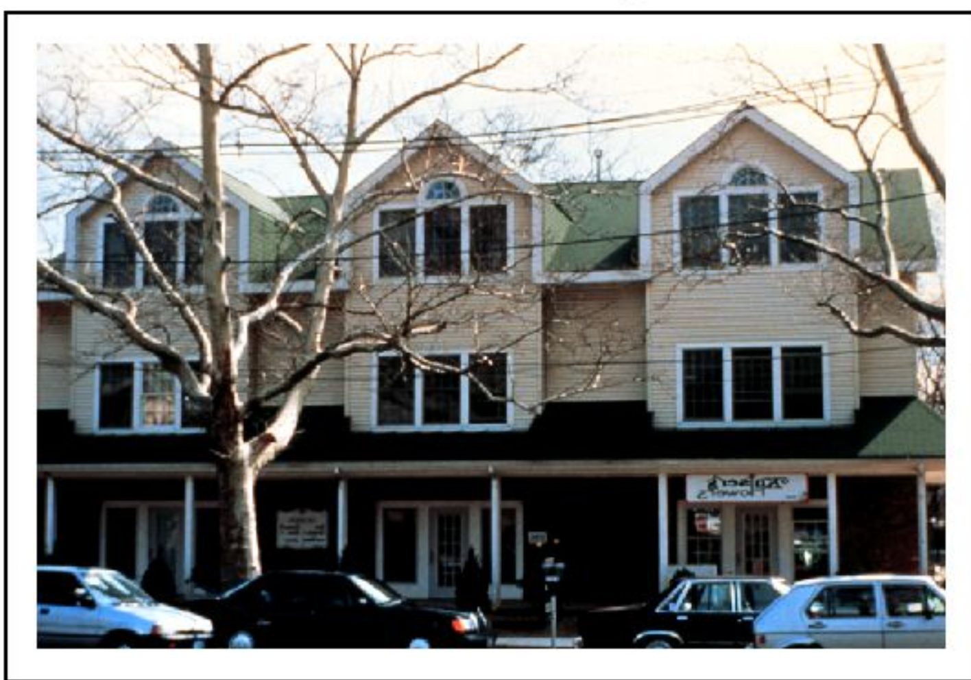
Ret/Office 3 Story TOD