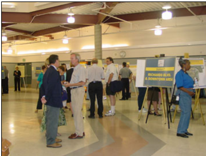
DNA Corridor Open House, July 23, 2003