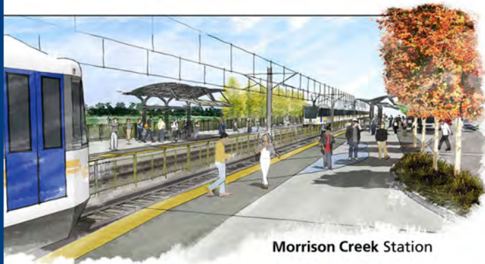
Morrison Creek Station