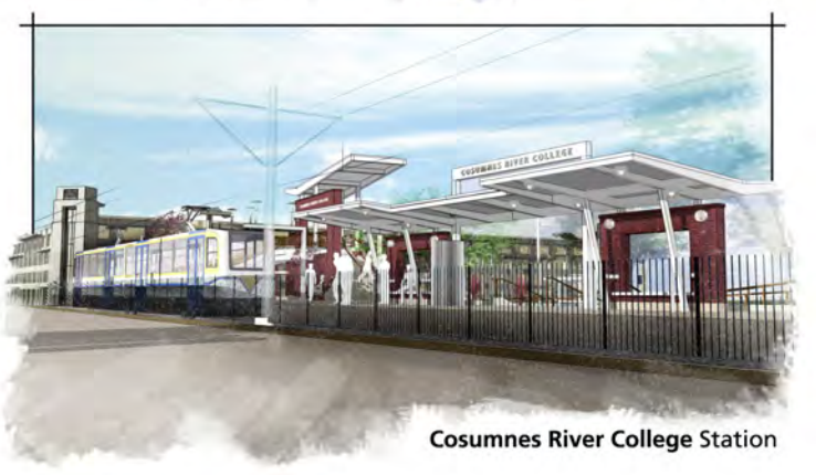
Cosumnes River College Station