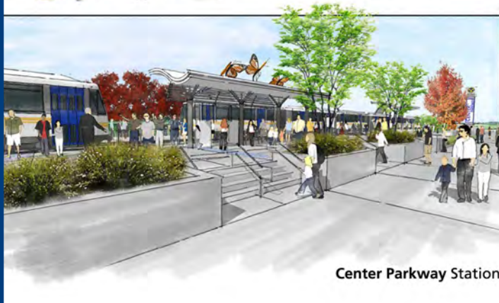
Center Parkway Station