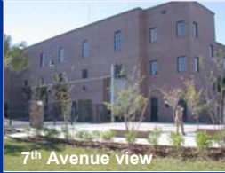
7th Avenue view

Recognized for outstanding design of an industrial building in a historic district